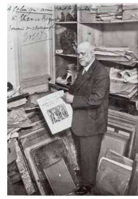
AMBROISE VOLLARD AT 28, RUE MARTIGNAC, c. 1932 black and white photograph Musée d'Orsay, Paris.

LIST WRITTEN BY JOHANNA VAN GOGH BONGER WITH 52 DRAWINGS SENT TO AMBROISE VOLLARD, INCLUDING 12 WATERCOLOURS FROM THE FRENCH PERIOD, 1896 no. 52 ("paysage 5")