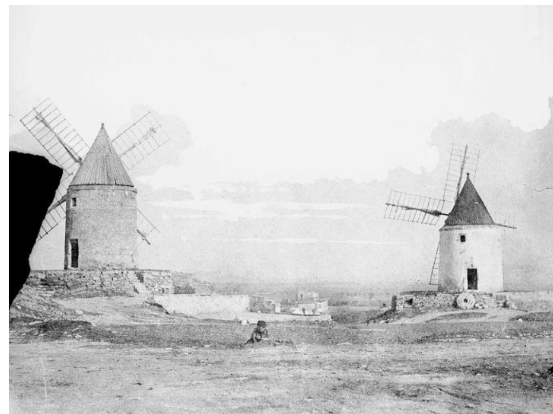
LES MOULINS DE FONTVIEILLE black and white photograph