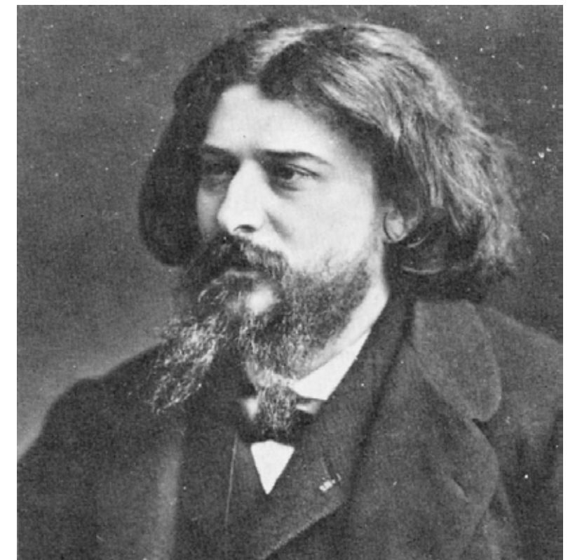
ALPHONSE DAUDET, 1891 black and white photograph

“As for landscapes, I’m beginning to find that some, done more quickly than ever, are among the best things I do” (letter no. 635, to Theo, 1 July 1888).