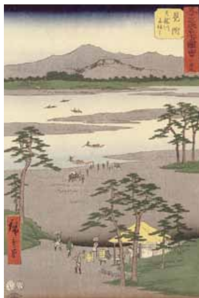
UTAGAWA HIROSHIGE Mitsuke: Ferries Crossing the River Tenryu , 1855 woodblock print.