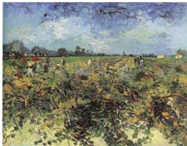
VAN GOGH Le Vignoble Vert , Oct. 1888, F475 oil on canvas 72 x 92 cm. (28 1 / 3 x 36 1 / 4 in.) Kröller-Müller Museum, Otterlo.

(LETTER 694, TO THEO VAN GOGH, WED 3 OCT 1888)